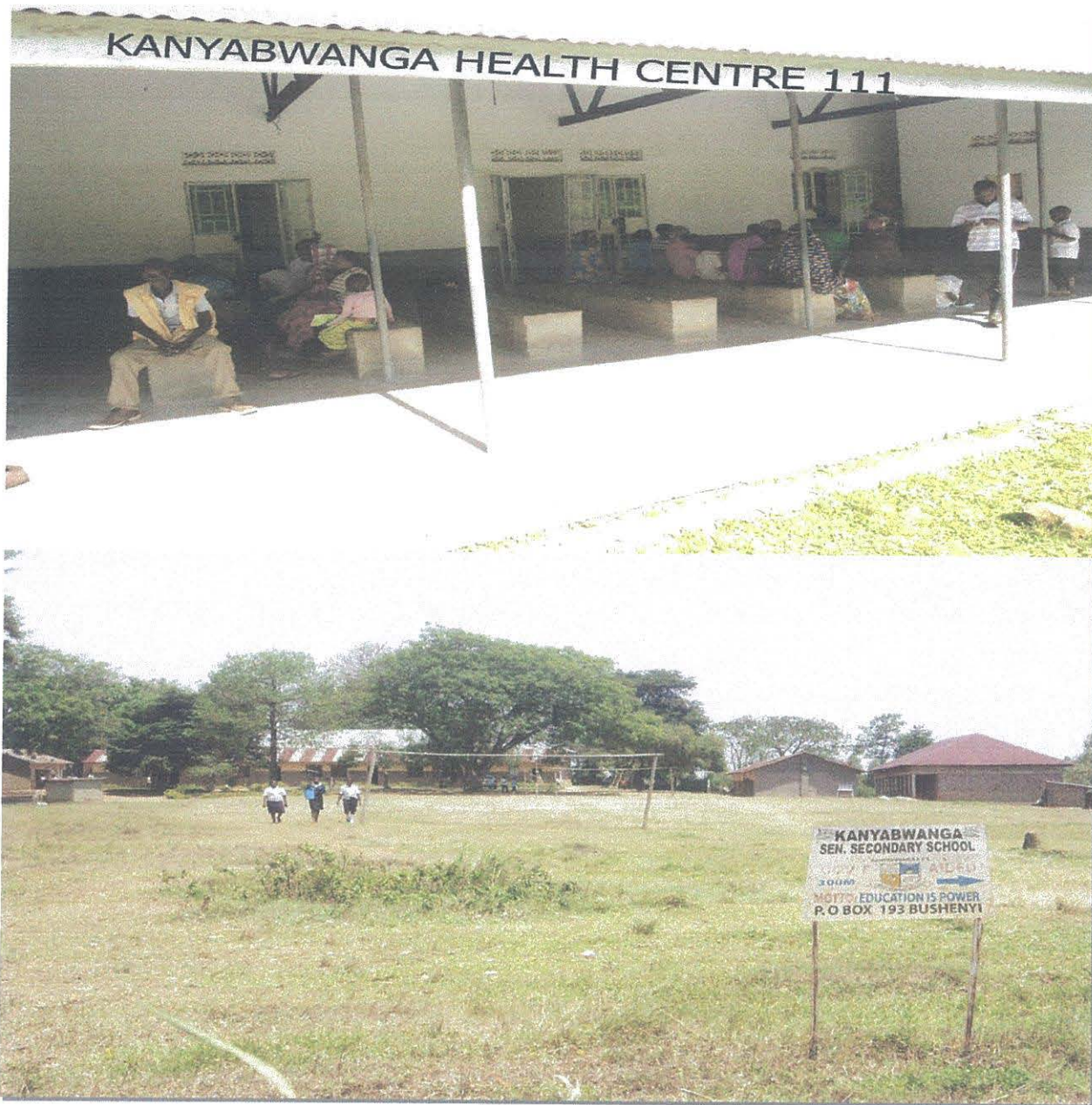
The plates showing Local Government Management and Service Delivery (LGMSD) fund facilities where the communities accessing health services