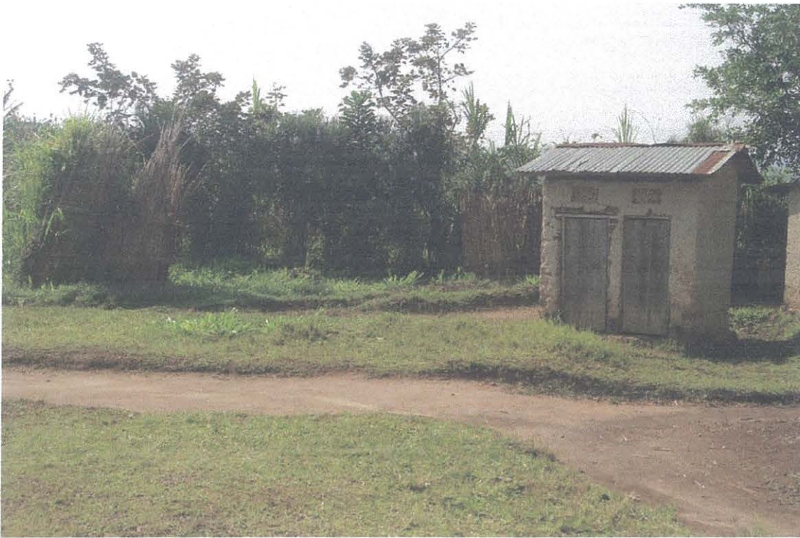
The plate above showing communities accessing the facilities built using locally mobilized funds

This implied that most of the external sources are conditional from that one used to provide specific services in the sub counties and therefore this money cannot be used for other things apart from the specified services by the grant in question which are in most cases conditioned to constructing schools and hospitals. From the plates or pictures indicated above, the first ones Kanyabwabga Health Center III, Kigarama Secondary Schools and Bitereko Health center III are the ones constructed using LGMSD funds and the second category of Kebiremu Primary school shows infrastructure developed by locally mobilized funds. This means that locally mobilized funds in the two sub counties are still low especially in Kanyabwanga sub counties as shown by the nature on the infrastructure developed respectively. Therefore the local population in the two sub counties need to be mobilized and sensitized so that the un tapped local revenue can be utilized to raise more funds and improve on infrastructure development in their sub counties as government grants like LGMSD funds are not enough to cater for all the community needs.