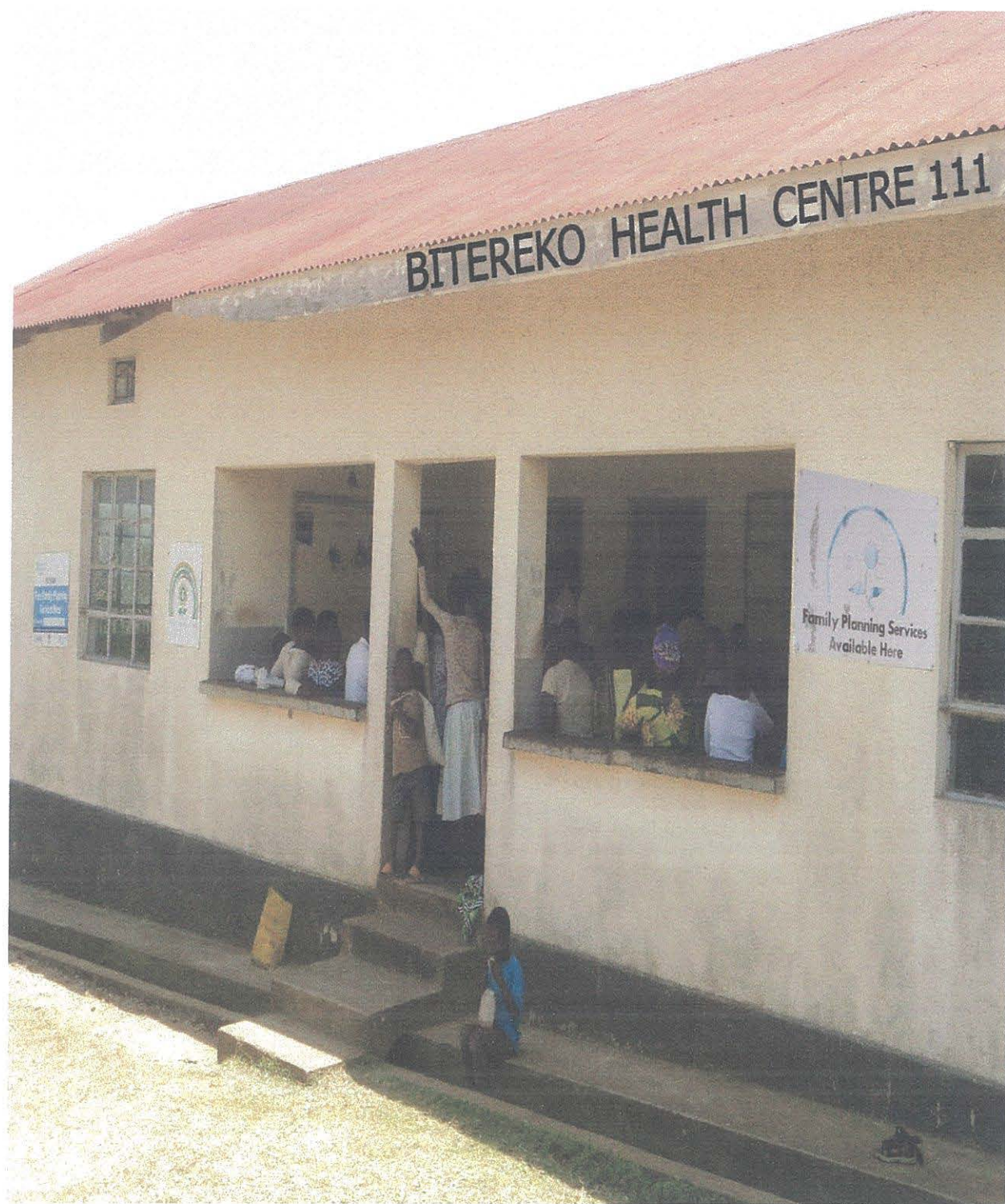
The plates showing Local Government Management and Service Delivery (LGMSD) fund facilities where the communities accessing health services