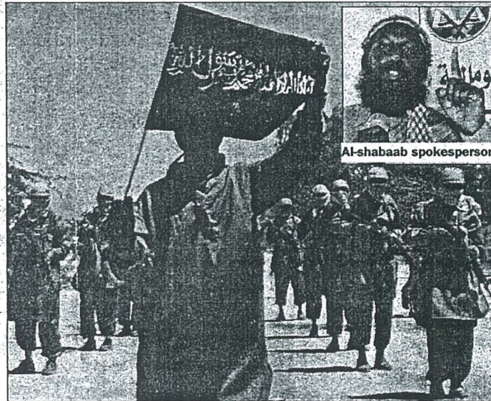
Somali-al-shabab-militants swear to finish off Uganda and Burundi

"Young men of ours, Al-shabab had carried out the blasts and they did as we wanted. We like to carry out other such explosions in the Burundian capital Bujumbura. So we are warning to the people of Burundi," said the spokesman of Al-shabab. More than 80 people were killed and many others were seriously injured in two explosions that occurred as soccer fans were watching the final game of the World Cup on July 11 in Kampala. Ugandan officials said Al-shabab fighters were behind the explosions as they were talking to journalists in Kam-