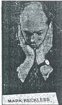
MARK RECKLESS KNOCKED THE FCUK OUT: Worst affected by the drinking session was Tory MP Mark Reckless

DOZENS OF MPs took part in a six-hour drinking session on the House of Commons terrace shortly before a crucial vote, reports the Daily Mail. Many were said to be under the influence when they finally made their way to the Chamber to debate on the Budget last Tuesday night. One Tory admitted he was too drunk to vote after he fell to the floor of a Commons bar, where drinks are heavily subsidised by the tax payer. One Cabinet minister was said to be slurring his speech. 'It was disgusting,' said a female MP. 'The Chamber and the voting lobbies stank of booze and sweat. There we were, voting through the most drastic Budget in decades, and some MPs barely knew where they were - let alone what they were voting for.' Worst affected was Mark